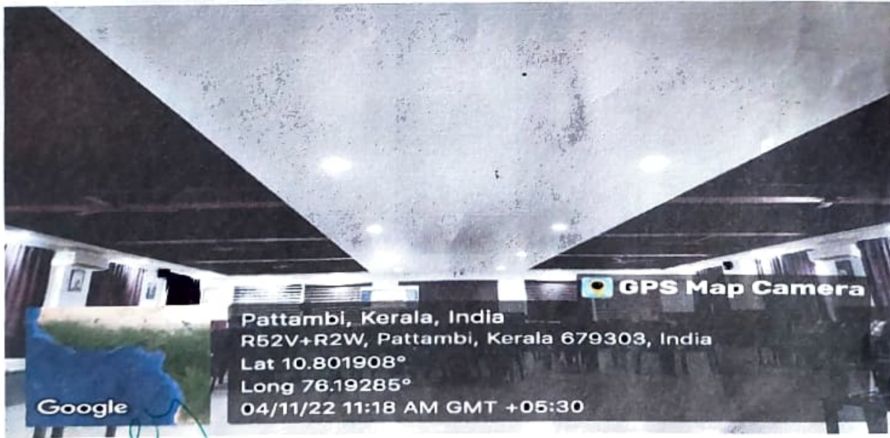
Utilization of LED bulbs

Shabeer K.P. Principal College of Advanced Studies Campus Mele Pattambi 679 306, Ph : 0466 2970041